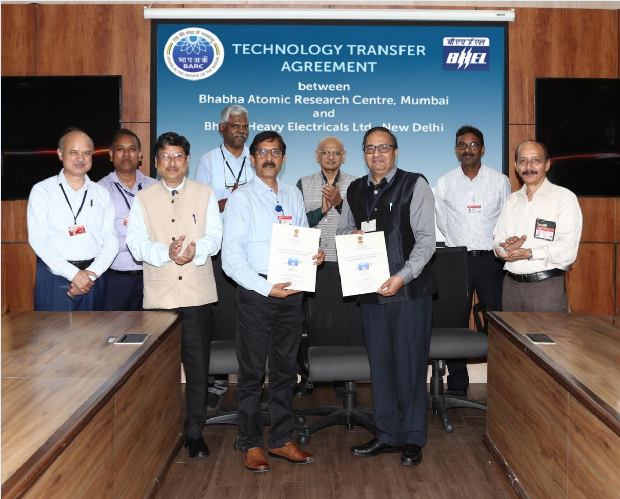
Technology Transfer Agreement with BARC