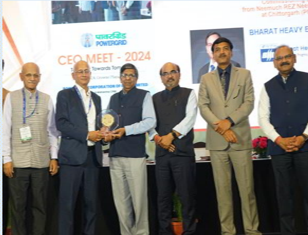
POWERGRID - CEO Meet 2024